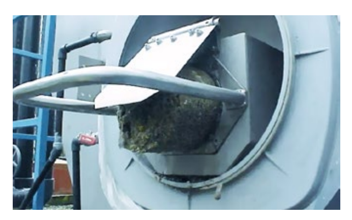
An efficient screw compactor for easy transport of waste

The Girapac screen is equipped with a screw compactor after the scraping stage, and the particles removed when coming into contact with the scraper drop into this compactor. The waste, which is conveyed by a shaftless screw towards a compacting zone, is retained in the