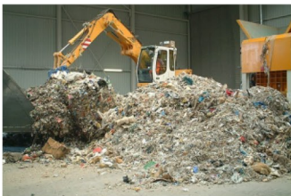
Municipal Solid Waste