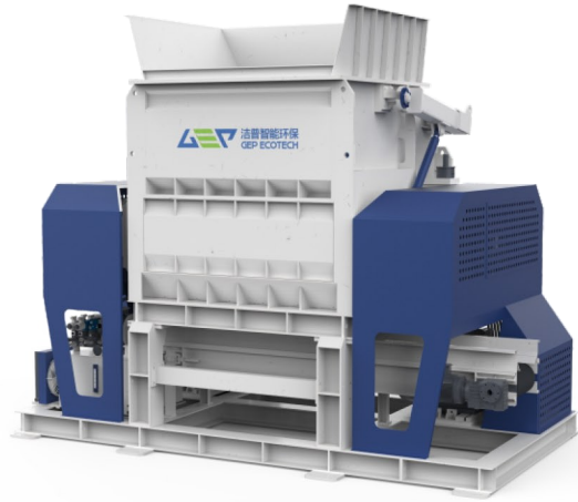
Single Rotor Fine Shredder