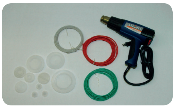
Tideland offers a variety of tool kits for minor repairs that may be ordered separately to assist in preserving buoys.